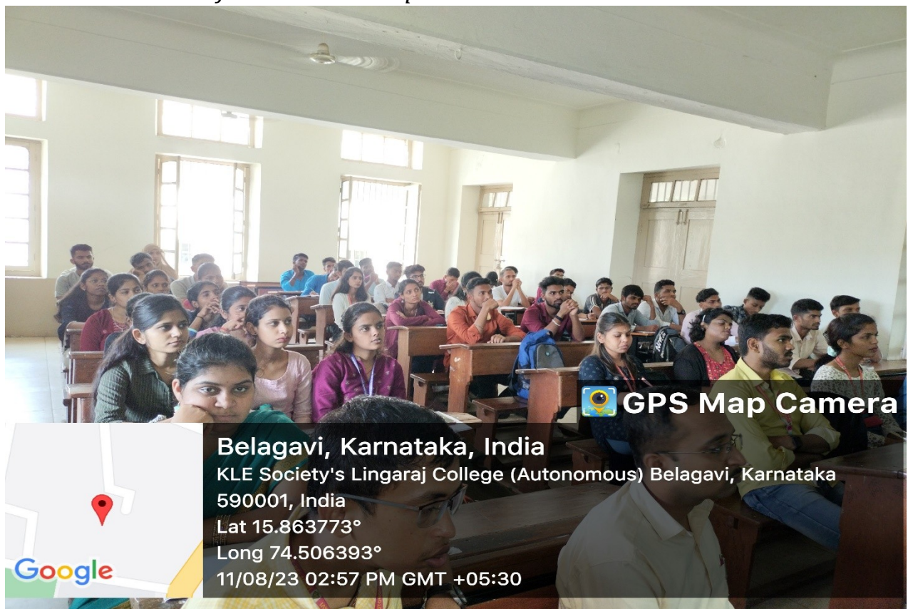
Student understanding and discussing about Stock Market Trading.